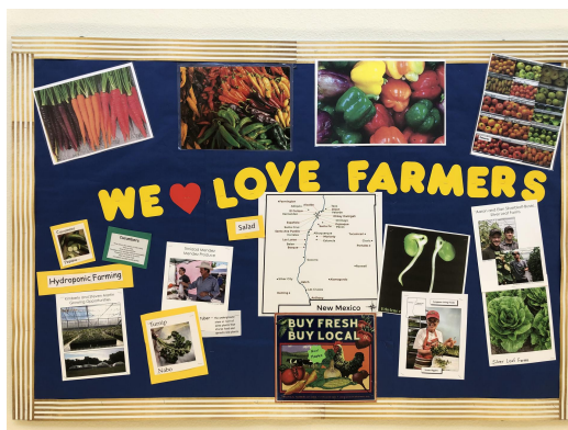
Thanks to a grant from NMDA, Cooking with Kids was able to purchase nearly HALF A TON of local produce for this activity!