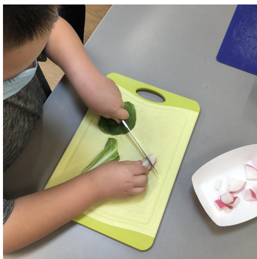
Kids sliced up local vegetables to make their own salads.

Plus they mixed up a simple creamy lime dressing—perfect for tossing over a whole salad or for using as a dipping sauce for anyone who prefers their salad "unmixed." Get the recipe here.